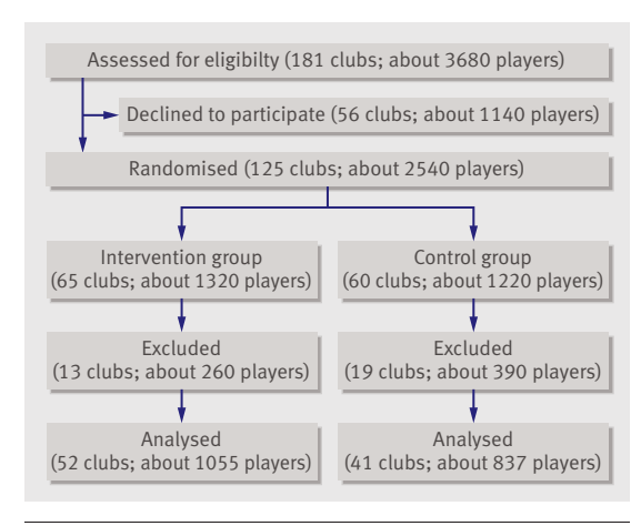
Fig 3 | Flow of club clusters and players through study

The mean age of injured players was 15.4 (SD 0.6) in the intervention group and 15.5 (SD 0.7) in the control group. Table 3 shows the most commonly injured