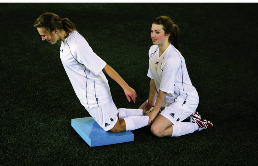
Fig 1 | Two examples of strength exercises. Top: side plank exercise. Bottom: the "Nordic hamstring lower"