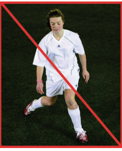
Fig 2 | Example of running exercise illustrating key objectives of all running, jumping, cutting, and landing exercises: core stability and correct lower extremity alignment. Left: correct technique; right: incorrect technique with pelvic tilt and knee valgus alignment to right

per club and a dropout rate of 15%, which means that we needed to include about 120 clubs with 2150 players.