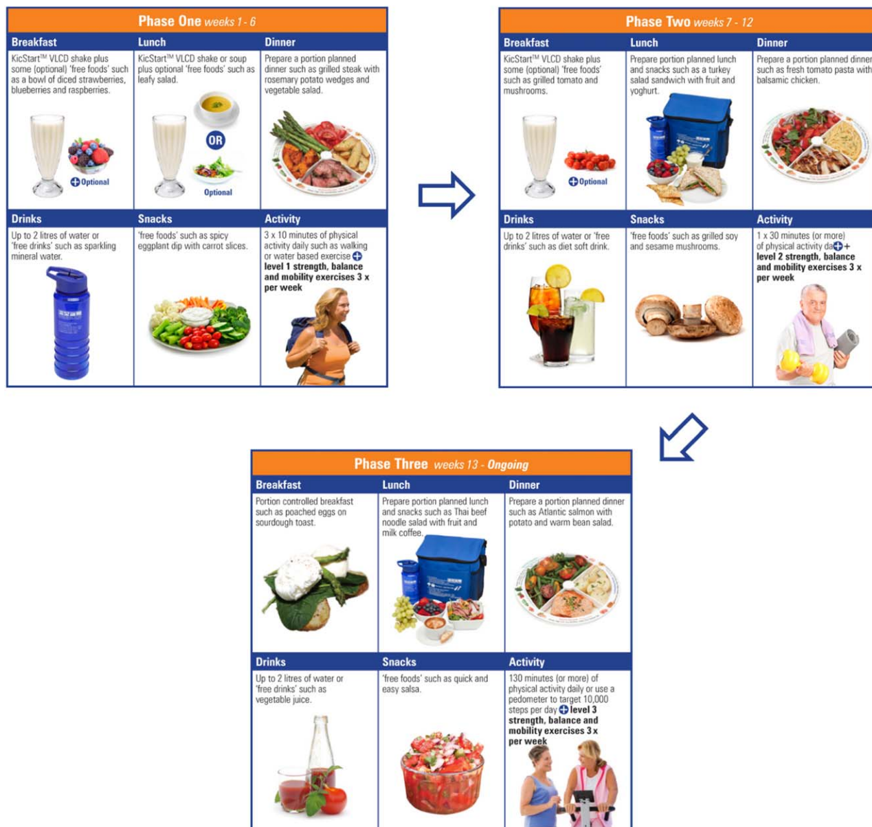
Figure 2. The 3-phase interventional structure of the Healthy Weight for Life online dietary control and behavior-modification program.

KOOS. A higher score in the WOMAC scale indicates a higher degree of functional impairment.